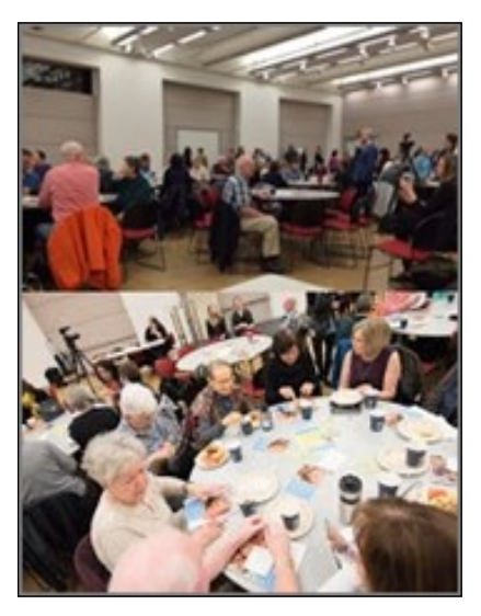
Vancouver audience enjoying the talks and lunch